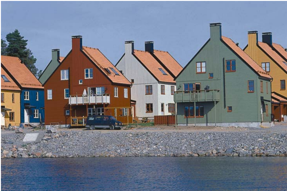
Attractive living conditions in the periphery of the Stockholm region. New housing area in Nyköping.

and from Nyköping. Of course, the intention is to make the Nyköping brand unavoidable for passengers flying with Ryan Air, many of whom are Stockholmers. Furthermore, the hits on the official Nyköping website have increased more than 200% since the banner was first placed on the Ryan Air website. The media attention that Nyköping has been getting after signing the agreement with Ryan Air, has been extremely valuable in itself. 1